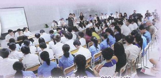
Showcasing in front of over 200 guests