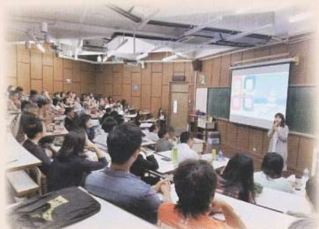
A talk on mental health of student

Teachers were grouped together to brainstorm new ideas for the School Development Plan for the coming 5 years.