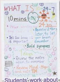
Students' work about their presentations