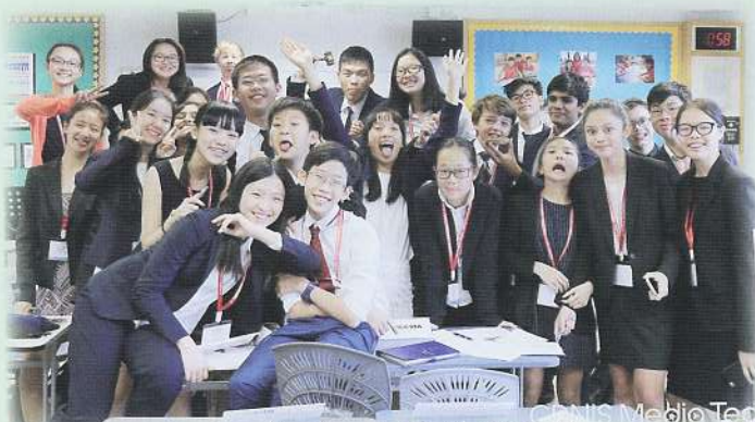
Delegates from the Human Rights Council