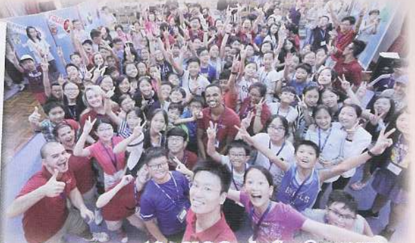
Happy faces at the QLS Graduation Ceremony