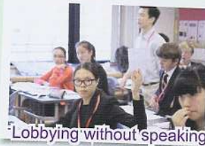
Lobbying without speaking