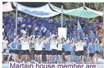
Martian house members are cheering for their house members

About 150 students participated in this year swimming competition, all competitors devoted their great enthusiasm in the gala and everyone tried their best to get the best result. The Boy's Overall Championships and Girl's Overall Championships were captured by Hewitt House and Martian house, respectively. Lastly, Priestley House won the title of Best Cheering.