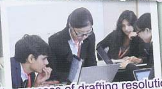
In the process of drafting resolutions

From 15 th to 17 th September 2017, the College sent a contingent of juniors to the annual MUN conference hosted by Canadian International School Hong Kong. Along with their peers from local and international schools, our junior debaters participated in three days of rigorous debates in the General Assembly, Human Rights Council, Security Council, Rapid Response Committee and Advisory Panel.