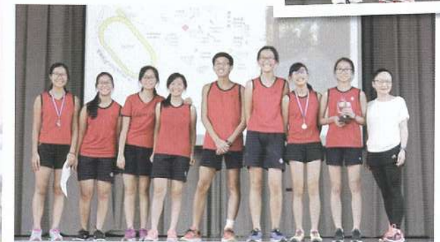
Boys C Grade and Girls C Grade