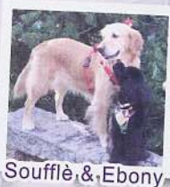
Soufflè & Ebony