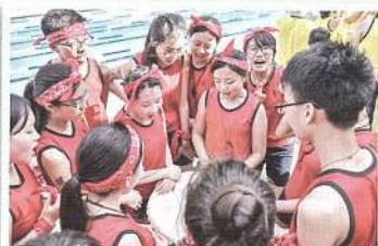
Hewitt House: We are the best!