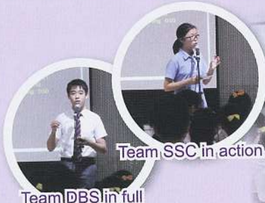
Team SSC in action

Team St. Stephen's was invited to join Team Diocesan Boys' School for a showcase debate in front of an audience of over 200 teachers and students. The motion was 'This house would legalize organ sale.' Team SSC was on proposition, while Team DBS was on opposition. The debate took place at The Yunni and Maxine Pao Auditorium, Diocesan Boys' School.