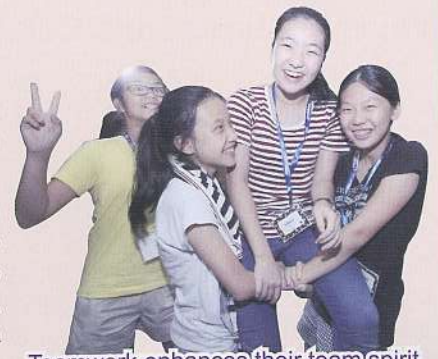
Teamwork enhances their team spirit and socializing skills

This camp aimed to enhance their learning skills such as memorization, note taking, reading, listening and writing skills, while building their confidence and motivation. The focus of the programme was also put on the concepts of the eight keys of excellence characters embracing Integrity, Failure Leads to Success, Speak With Good Purpose, This Is It, Commitment, Ownership, Flexibility and Balance. On the graduation day, their parents had a chance to experience what they had learned through their presentations and different activities. Overall, this programme was very well received by the students and the parents.