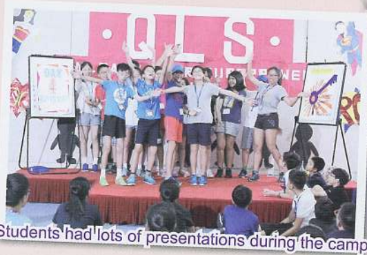
Students had lots of presentations during the camp