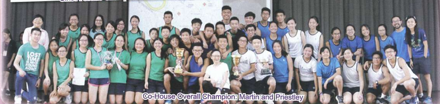
Co-House Overall Champion: Martin and Priestley