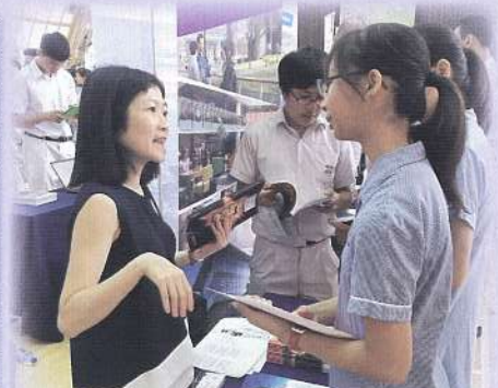
Senior students take the initiative to ask for more information.