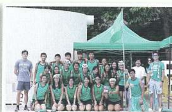
Priestley House winning the title of best cheering house!