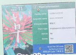
One of the many informative nature trail points found dotted around our campus. Make sure you scan the QR codes with your mobile device!