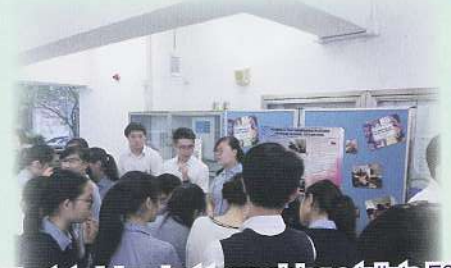
The tutorial project team giving a talk to F3 students about how they taught primary school students Maths & English.