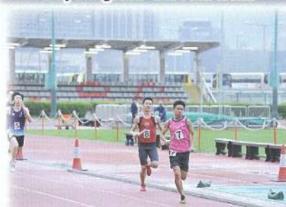
Boys A grade 4x400m came 4th