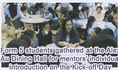
Form 5 students gathered at the Alex Au Dining Hall for mentors' individual introduction on the Kick-off Day

In collaboration with the SSC Alumni Association, the annual Mentorship Programme for Form 5 students kicked off on 16 November 2017. More than seventy Form 5 students signed up. They received guidance and advice on career choices and life skills during the year from December to June through company visits, job shadowing and other activities as agreed by the mentors and the mentees. The mentors are from diverse professions such as finance, IT and gaming, medicine, law, real estate, fashion design, sea piloting, advertising and logistics.