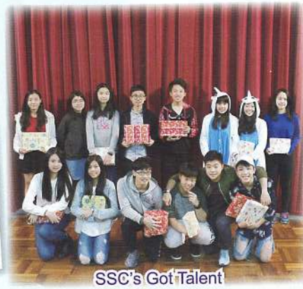
SSC's Got Talent