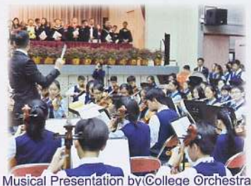
Musical Presentation by College Orchestra

This year, the College is delighted to have the first batch of 128 students graduating from our dual programme, the HKDSE cum IBDP. Many of the DSE and IB students received offers from Cambridge University, the London School of Economics, Imperial College London, University College London, University of St Andrews, University of Southern California, University of British Columbia and University of New South Wales. Locally, students have enrolled in Medicine, Biomedical and Health Sciences, Engineering, Physiotherapy, Pharmacy, Business, Law, Economics, Education and Architecture.