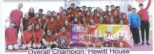
Overall Champion: Hewitt House