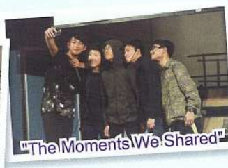
"The Moments We Shared"