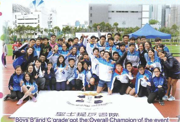
Boys B and C grade got the Overall Champion of the event

Those medal winners are listed as follows: