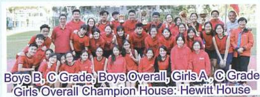
Boys B, C Grade, Boys Overall, Girls A, C Grade Girls Overall Champion House: Hewitt House