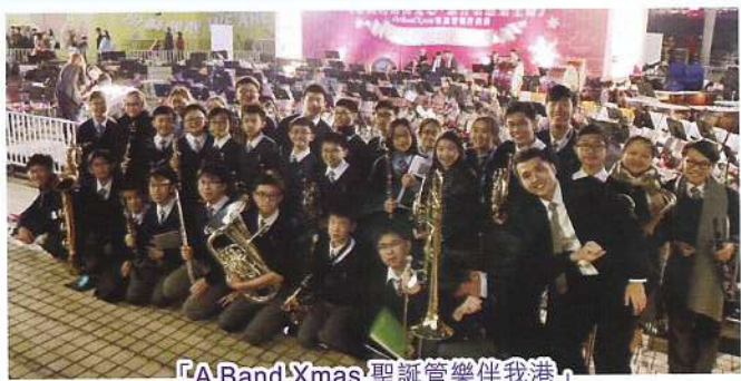
「A Band Xmas 聖誕管樂伴我港」