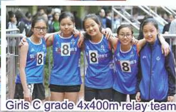
Girls C grade 4x400m relay team