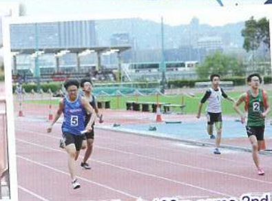
Boys B grade 4x100m came 2nd