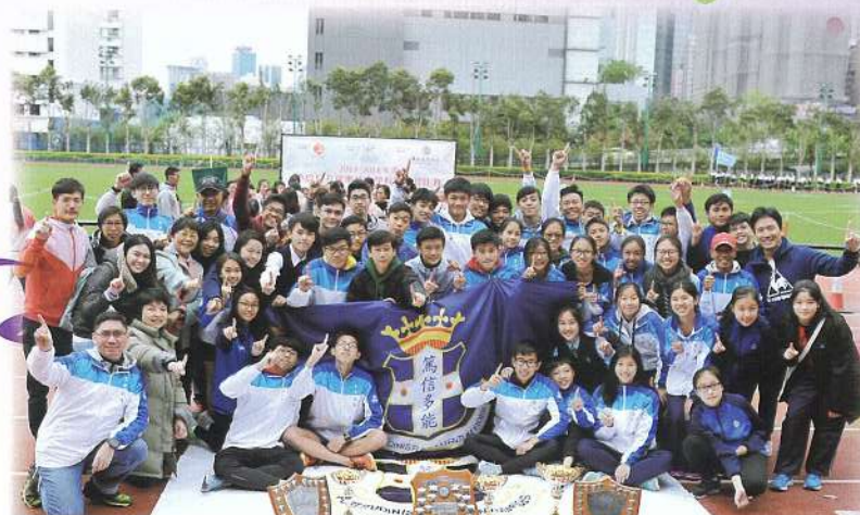
Boys: Overall Champion