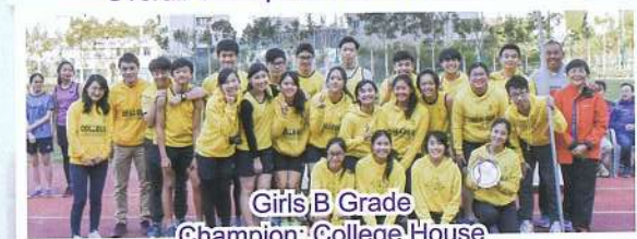
Girls B Grade Champion: College House