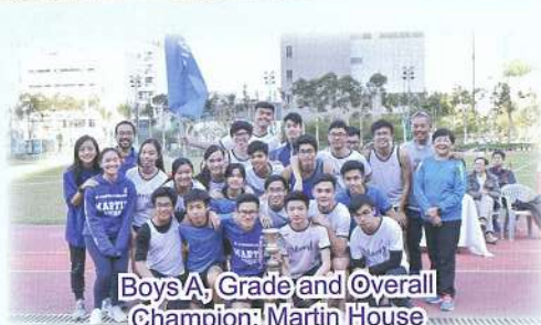
Boys A, Grade and Overall Champion: Martin House