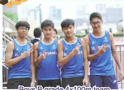
Boys B grade 4x100m team