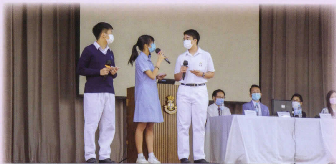
Students sharing about their enriching school life