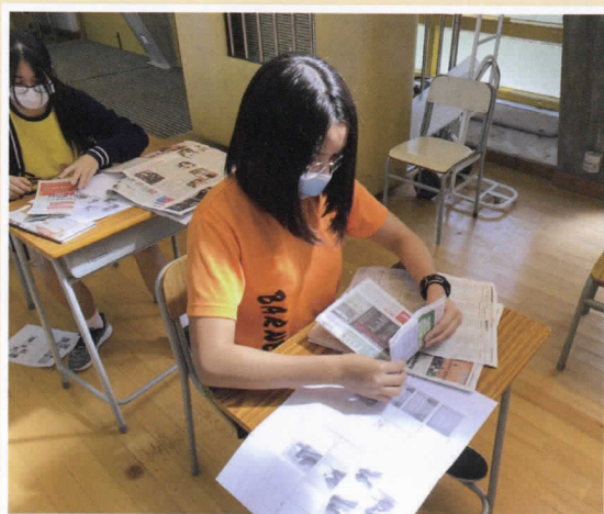
Supervisor checking quality of work based on strict rules