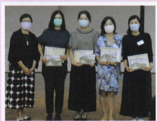
S1 Class Representatives