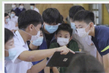
Discussing strategies before the start of a mini game