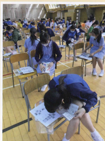
The sweatshop group working hard to get their lunch