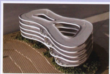
A miniature model of a retirement village in Stanley constructed by the 'Architects' group