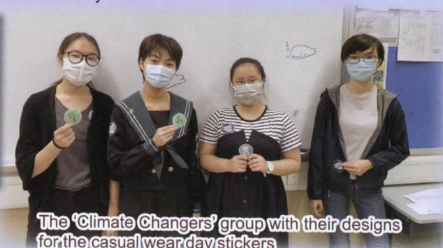
The 'Climate Changers' group with their designs for the casual wear day stickers