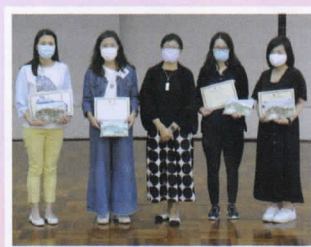
S3 Class Representatives