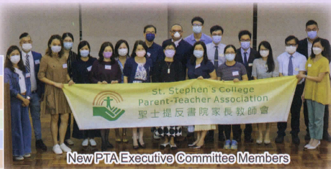
New PTA Executive Committee Members