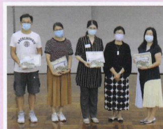
S4 Class Representatives