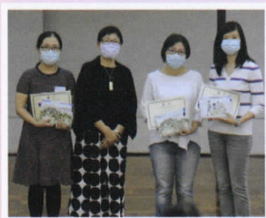
S2 Class Representatives