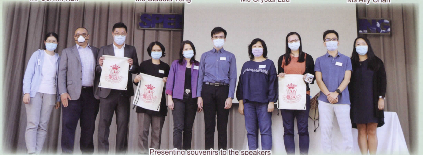
Presenting souvenirs to the speakers