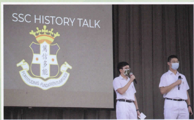
Talk on SSC History