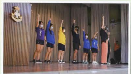
Interactive street dance show – students learning street dance on stage