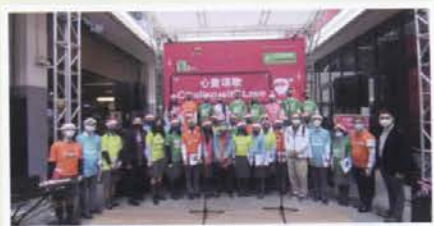
於中環街市演出前同學與贊助人合影