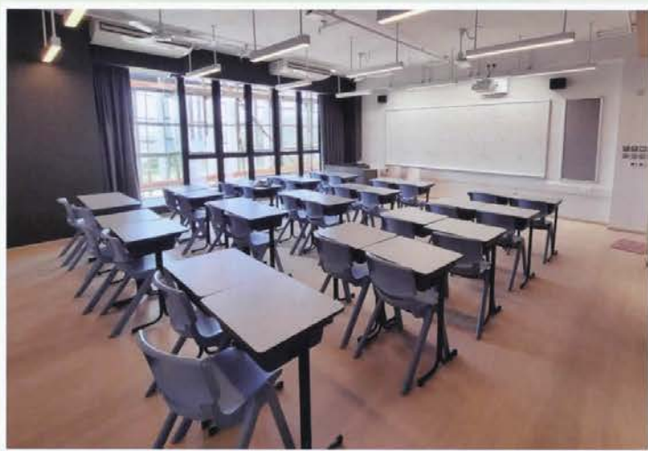
Classrooms Modern learning environment with innovative technology