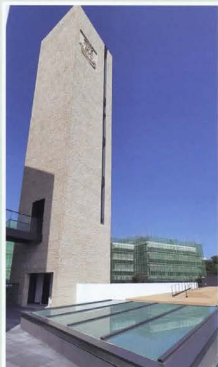
Bell Tower The newest landmark on campus