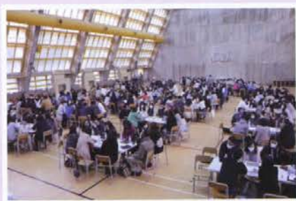
Joint-school Staff Development Day on 4 th January