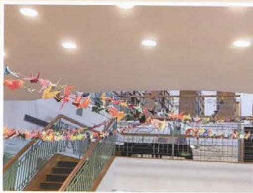
The marvellous origami installation is currently inside our School Library!