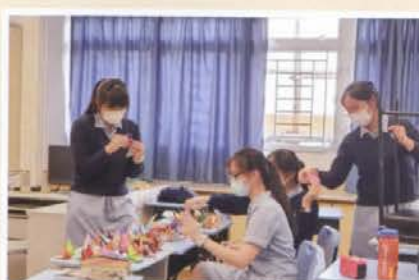
Members of the College Ambassadors are stringing the origamis together