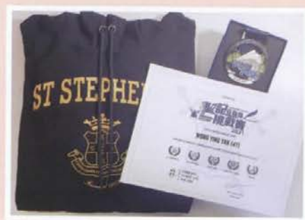
The certificate, commemorative medal, and SSC-Special Hoodie

With the support of teachers through social media promotional activities, over 300 participants accepted the challenge, raising over $170,000 for our school. All proceeds went to the school development project "Inherit & Innovate", which includes the new building - Benevolence House. To recognise their achievements, all successful 'conquerors' were rewarded with certificates. Furthermore, commemorative medals engraved with the School House design and SSC hoodies were given to participants who had raised over $200 and $500 respectively. Some 'success stories' can be found on Instagram @st.stephens.family.