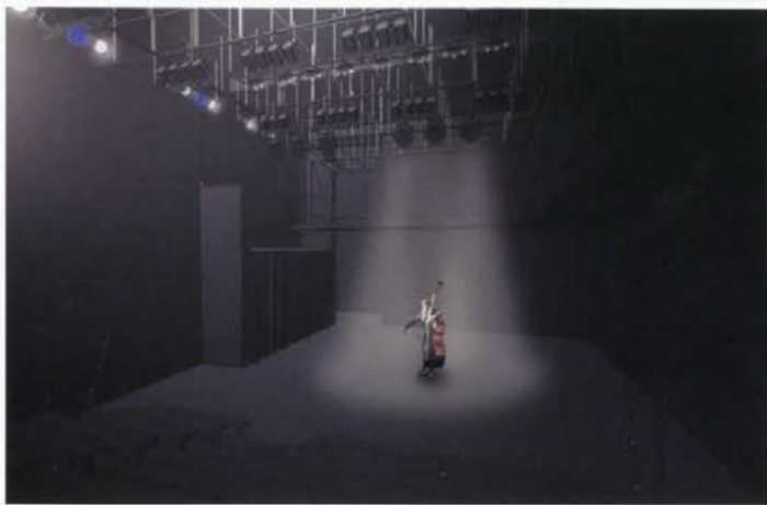
Black Box Theatre For our exceptional drama and musical productions