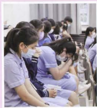
Let us pray