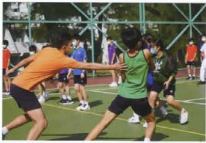
'Be Courageous' inter-class competition – classes working together on challenging tasks

To promote the theme of values education, 'Be Bold! Be Courageous!', the Moral and Civic Education Committee organised a series of activities, including a board decoration competition, the 'Be Courageous' inter-class competition and an interactive street dance show. Students were encouraged to take up challenges and overcome difficulties through unity.