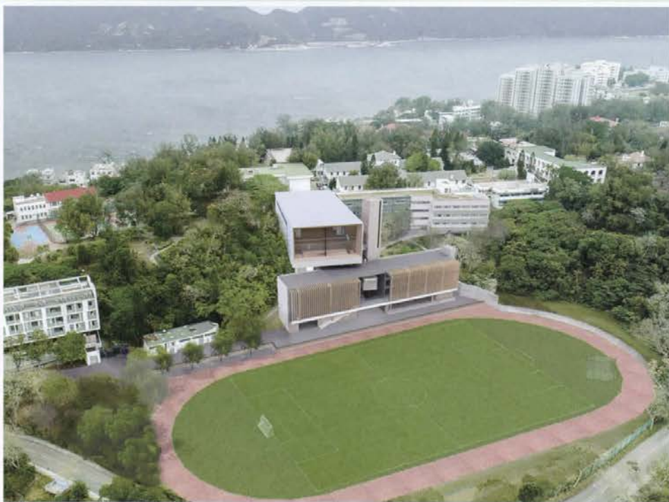
Tang Shiu Kin Sports Field and SSCAA Outdoor Track The premier sports venue for future generations of SSC elites