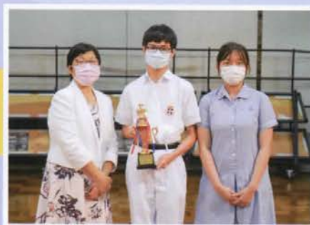
弦樂四重奏小組榮獲 銅獎