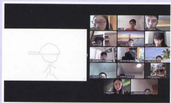
Guess what the next item will be