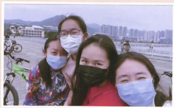
Conquering the extreme cycling challenge while having some great fun with friends

I accepted the extreme challenge of cycling more than 36 kilometres, and I succeeded with a round trip of 50 kilometres from Sha Tin to Tai Mei Tuk. This strenuous yet spectacular experience not only allowed me to exceed my limits, but it also provided me with the opportunity to immerse myself in the tranquillity of nature. I am beyond grateful for the personal breakthroughs and the escape from urban bustle.