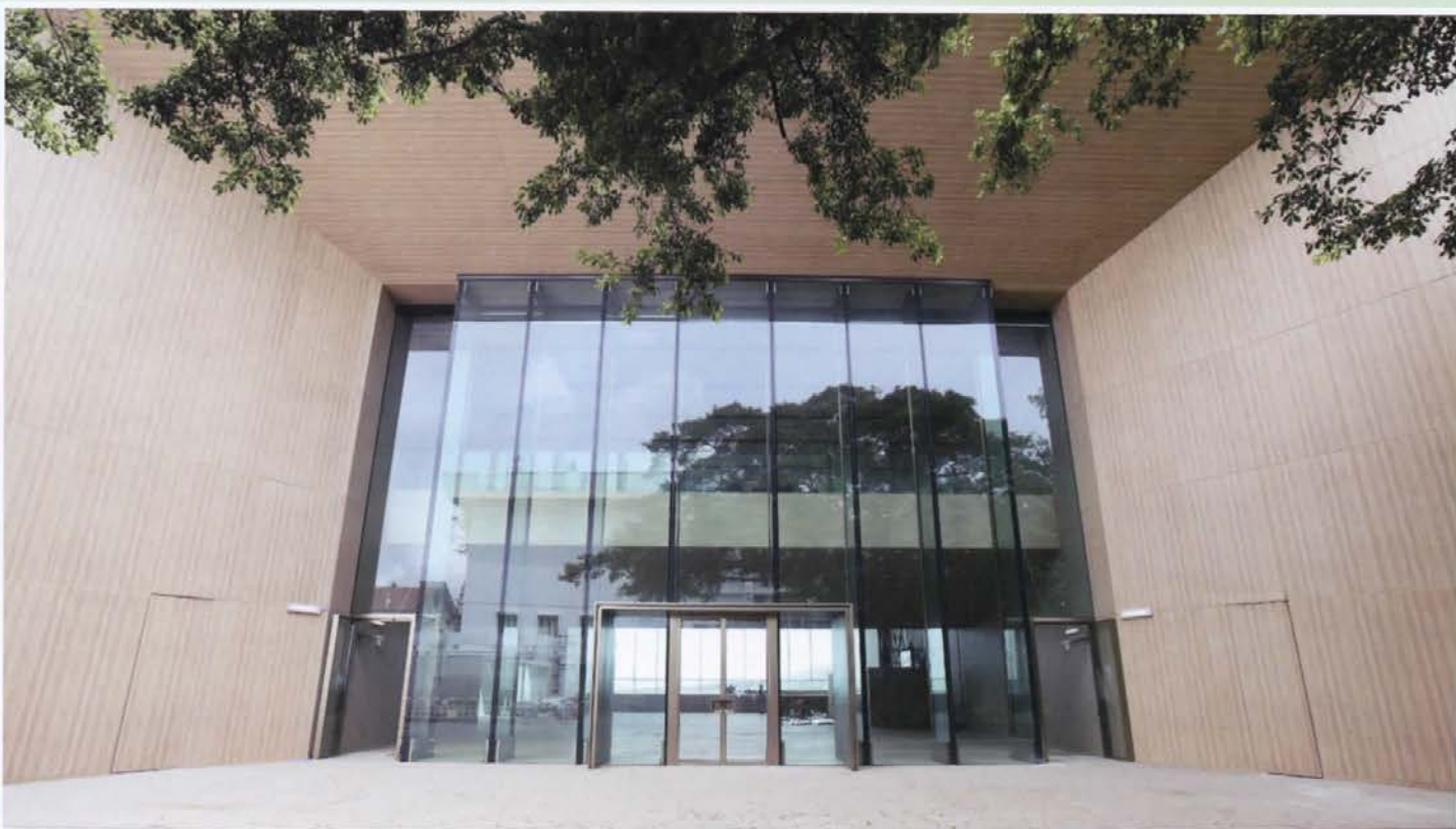
Grand Hall The centrepiece of the entire project