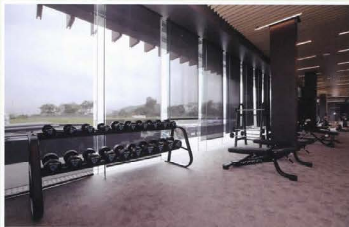
Indoor Fitness Centre Development of an active and healthy lifestyle