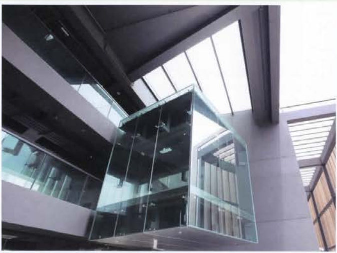
Trophy Room Accolades garnered over the years showcased