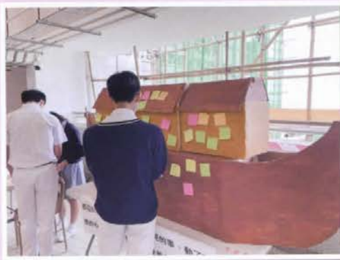
The Covenant of Rainbow