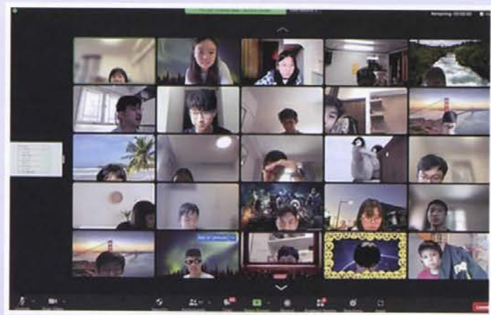
I got the jacket!

Our Heritage Society held a training camp in April during the special summer holiday. As a docent committee member, I really enjoyed the event and was touched to see participants putting their hearts and souls into the activity. They enjoyed the game while we committee members enjoyed interacting with them. We had a fantastic afternoon.