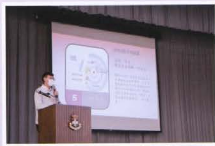
Speaker from EDB conducting the talk on National Security Education (4 th Jan)